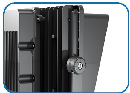
Angle adjustment disc