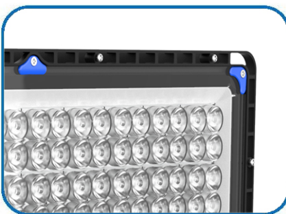
Philips high brightness led chip (210 lm/W) Precision lens (7°/15°/30°/60°/90°)