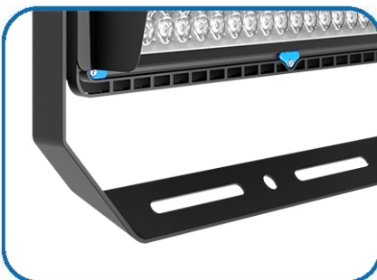
High strength anti vibration bracket