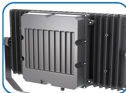
Independent waterproof power box