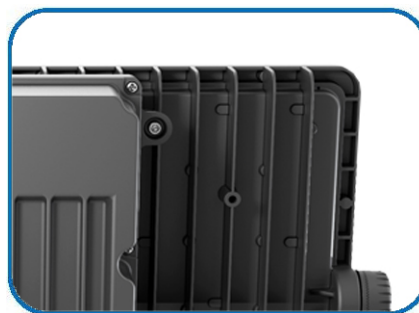
High thermal conductivity die cast aluminum shell